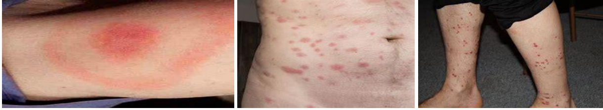
Top Left- Bed bugs, flea, lice