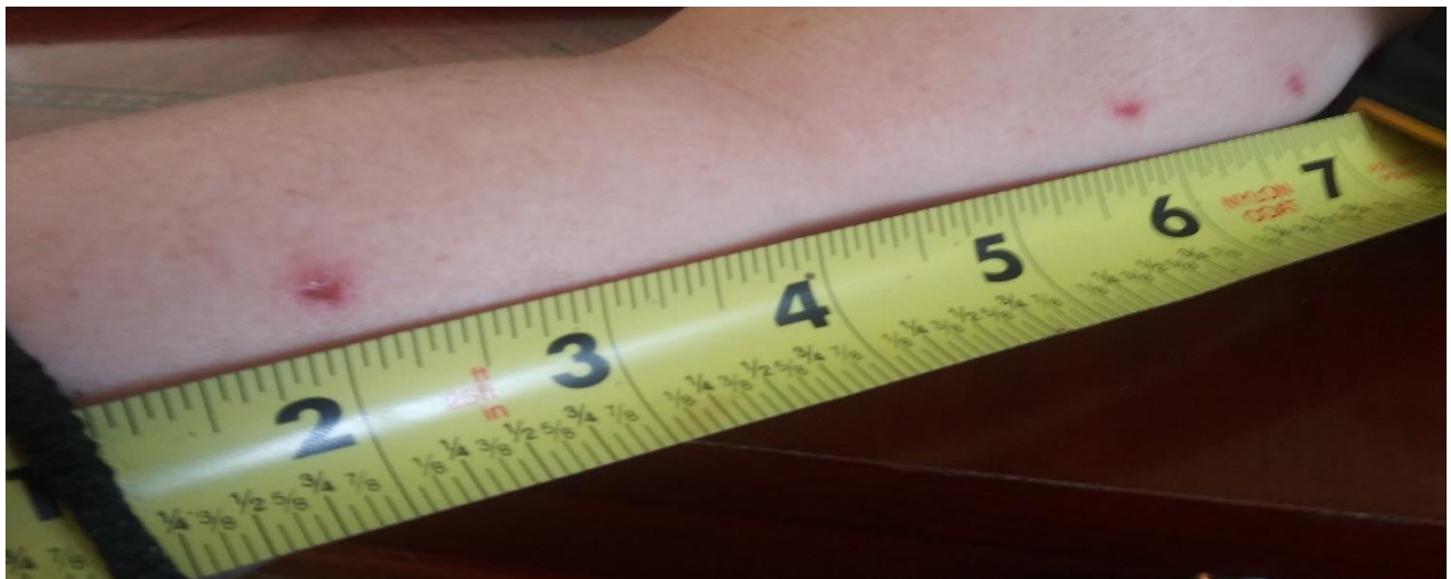
Figure 1. Measuring Weapons on Left Arm Past the Wrist (Amy Holem).

The First step is to measure out the distance of the attacks. Dr.'s along with law enforcement love to say, "Those look like bug bites." If you measure out all the attacks, there are known distances that prove they are not bug bites. As you can see from Fig 1. Below you can see the marks are at the 2-inch mark, 6-inch mark and 7-inch mark. Each mark is 2-6=4 inches apart and 6-7=1 inch apart.